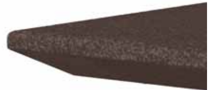
40733 1.18" (3 cm) thick reverse knife edge, quartz. Polished edges.