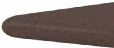
40722 1.18" (3 cm) thick bullnose quartz. Polished edges.