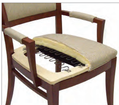
Sinuous Spring Seat