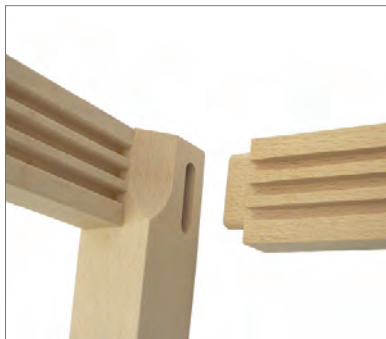
Mortise and Tenon Joints