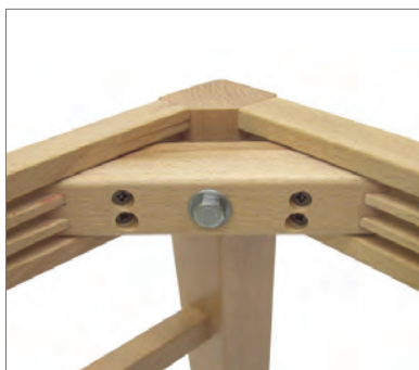
Corner Block System with Center Lag Bolt and Hardened Screws Note: Construction may vary from style to style.