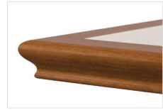
24060 Wood 1.25" x 1.25"