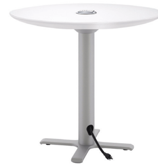
400 with FLX Power Management