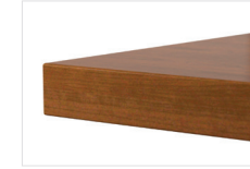
17360 Random Plank 1.25"