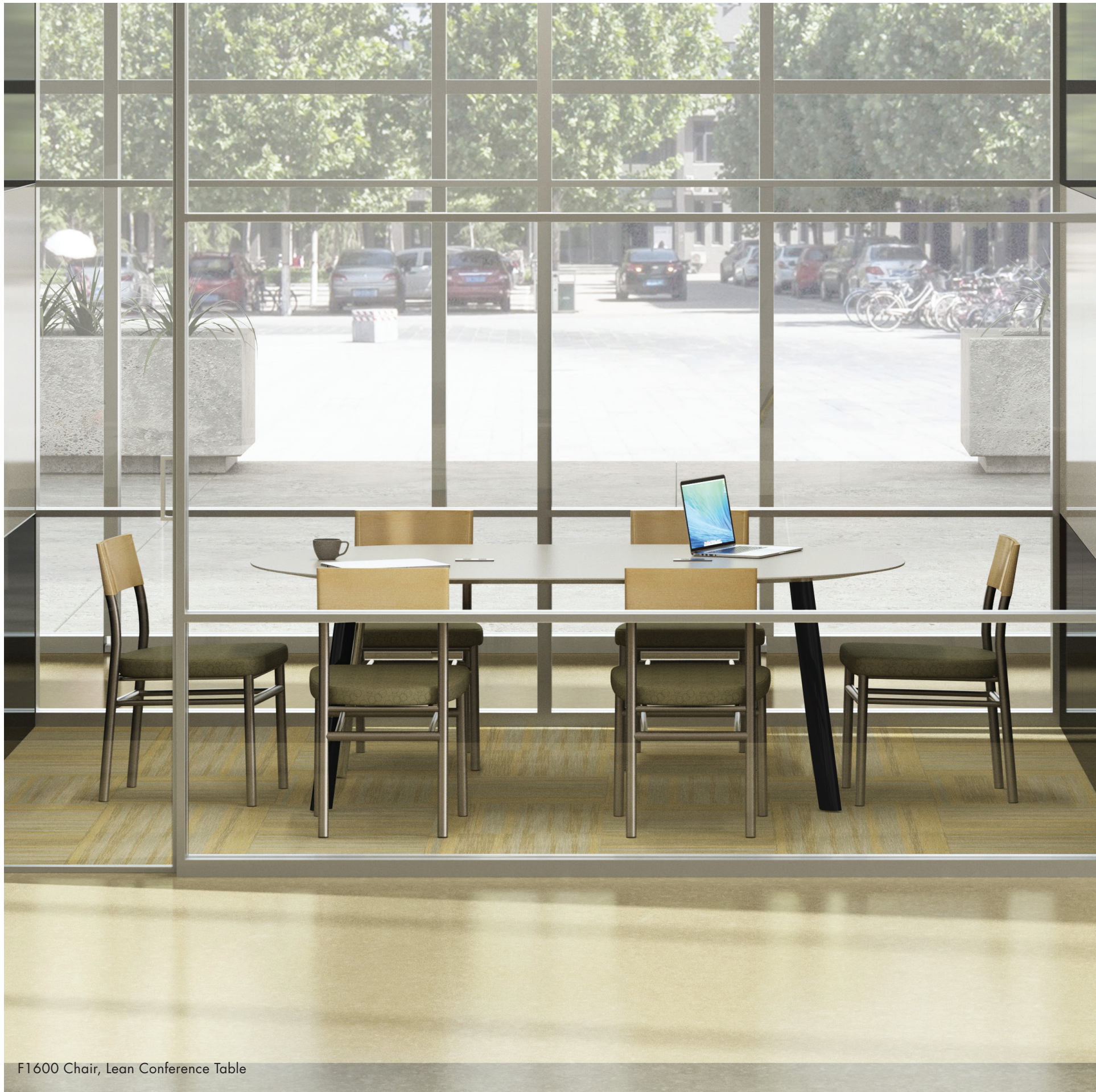
F1600 Chair, Lean Conference Table