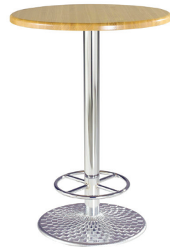
4100 in Bar Height with optional footring