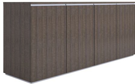
55-LM722429 Media Credenza