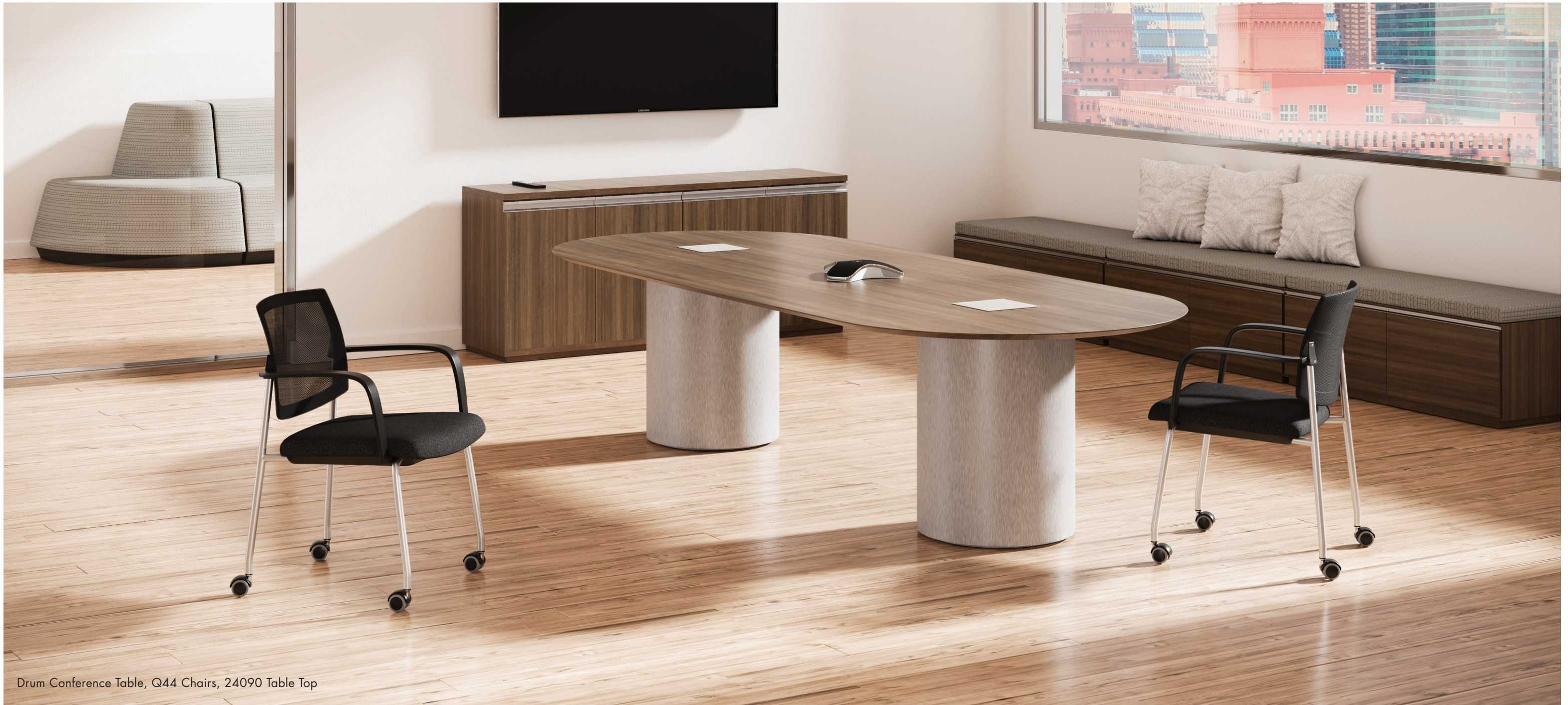
Drum Conference Table, Q44 Chairs, 24090 Table Top