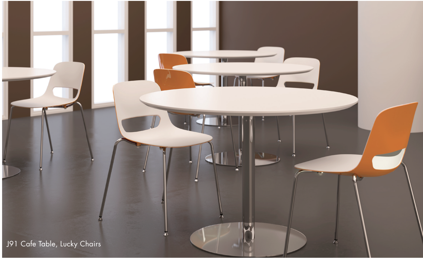
J91 Cafe Table, Lucky Chairs