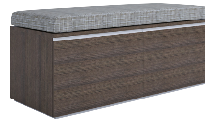
55-STB481624 Storage Bench