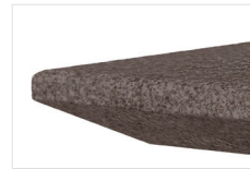
40733 Quartz, 3 cm