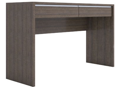
55-SP244836 Parsons Table