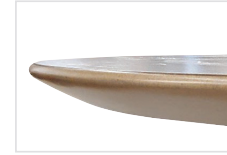
22090 MDF 1.25"