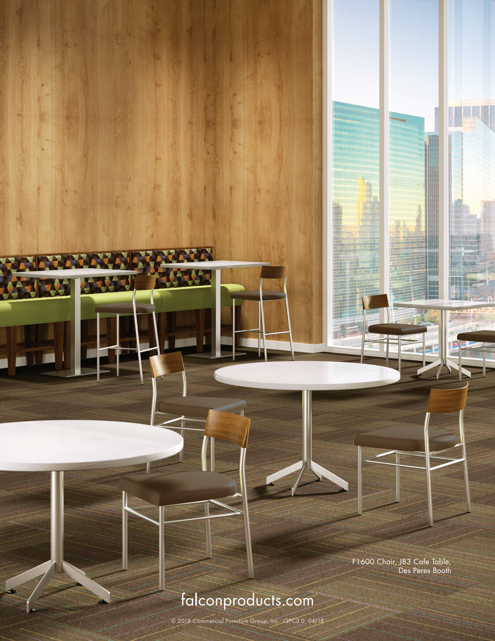
F1600 Chair, J83 Cafe Table, Des Peres Booth