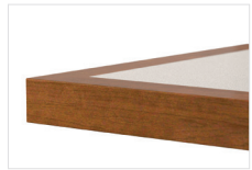
24000 Wood 1.25" x 1.25"