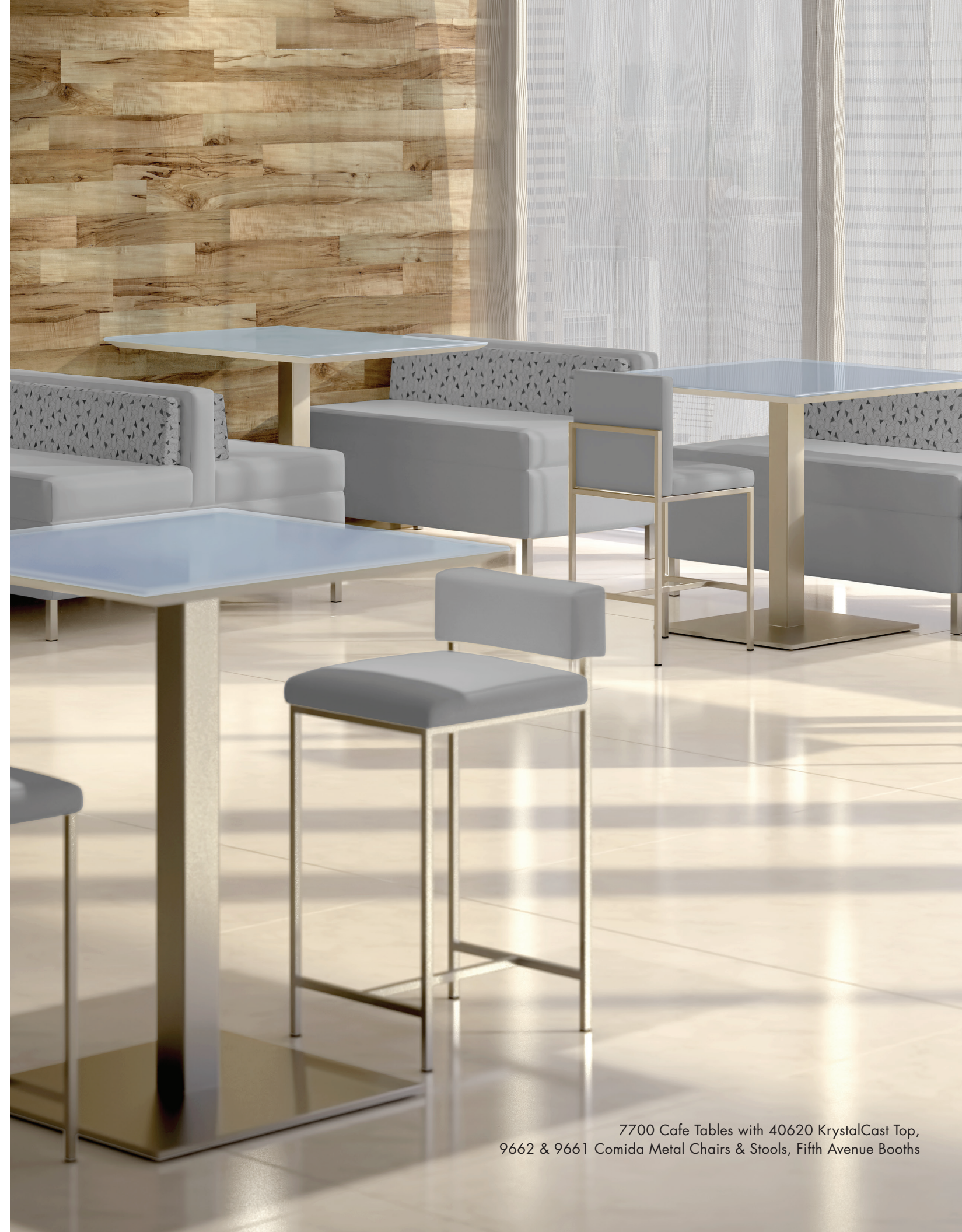
7700 Cafe Tables with 40620 KrystalCast Top, 9662 & 9661 Comida Metal Chairs & Stools, Fifth Avenue Booths