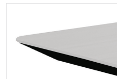
72120 Ecortop 5/8"