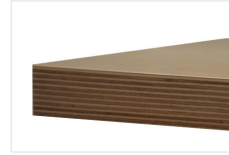
15400 Plywood 1.25"

Visit Falconproducts.com to see more. Ask us about custom logo table tops.