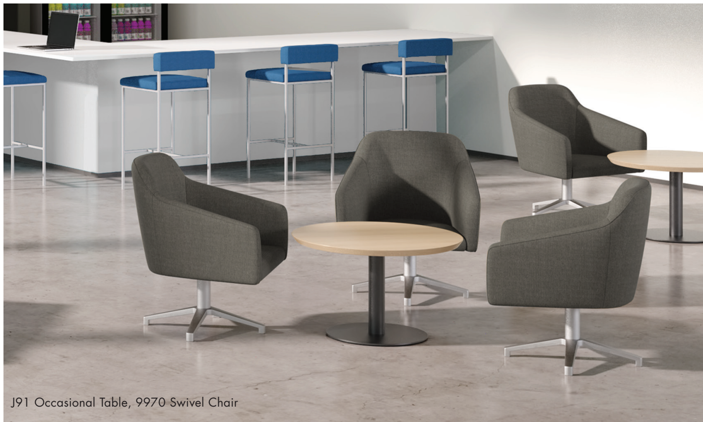
J91 Occasional Table, 9970 Swivel Chair