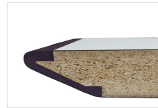
71120 Knife Edge Urethane 1.25" x .375"