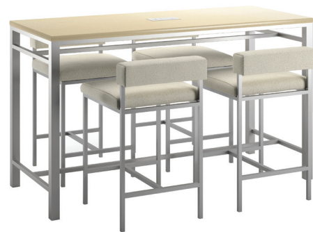
80ST Table with 9680 Stools