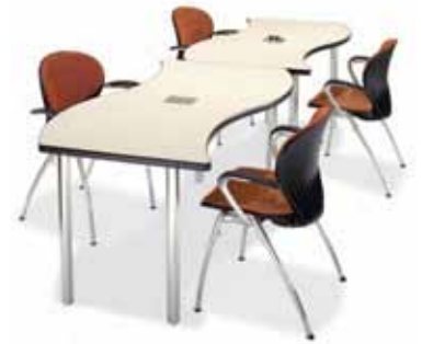
Curv 65CV Community Tables