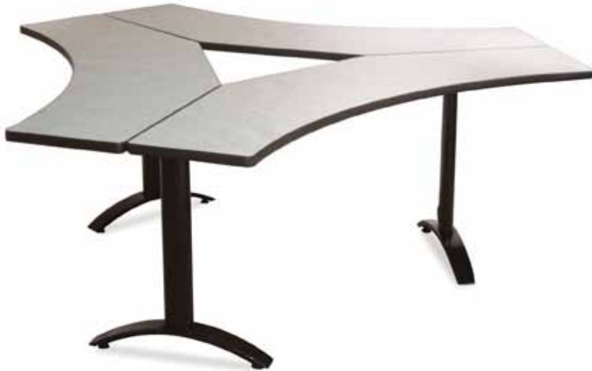
Syntech 25NW Network Pod