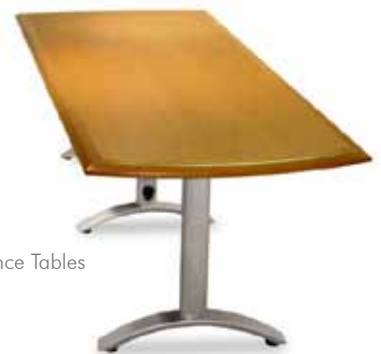
Syntech 25SS Conference Tables

Syntech is a contemporary table system, flexible enough to be used in classrooms, training rooms, or meeting rooms. Cantilever or symmetrical leg options allow the product to be used with standard rectangular tops or applied to free-form shaped tops. These options help foster collaborative environments. The design can be freestanding or utilize a shared leg configuration, designed to reduce leg obstructions and cost. The extruded aluminum column has integrated power management and features several power options. Syntech is available in a variety of metal finishes, laminate and edge colors, and several edge profiles.