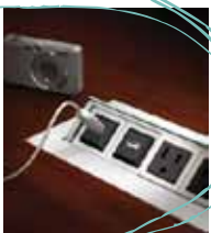
USB Mini Port

MATS has many power choices to support today's technology, both hardwired and portable options, including USB 2.0 and iPod/iPad connections for tuned in students. Power and data are available on the work surface, so students can plug in hassle free. MATS features wire galleries that provide for separation between power and data. Availability of back-to-back power distribution reduces cost by powering only one row. All MATS tables feature a variety of leg finishes, laminates, edge color choices, and edge profiles.