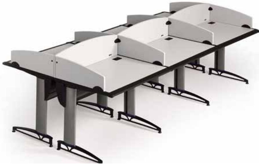
MATS 41S2 Shared Leg Stationary Tables

MATS table system has a wide variety of features and options to suit any learning configuration. Freestanding and portable MATS are ideal for collaborative, flexible environments, while shared leg versions support training room applications. The permanent mount table and seats are appropriate for lecture halls.