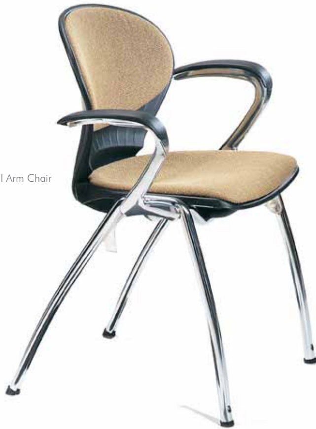
GT506-1 Metal Arm Chair