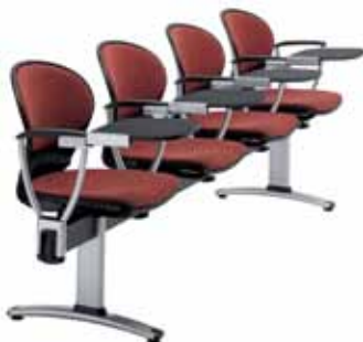
Beam Seating with Tablet Arm

Falcon's Verona™ is a collection of ergonomically superior, stackable chairs, which feature back alignment and support that automatically adjusts to the size of the user. For spaces that need to be reconfigured, the tough tubular steel frame chairs stack six high and are available with casters. Verona's™ ergonomically contoured task chairs provide ease of movement, exceptional comfort, and pneumatic seat height adjustment.